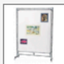
5x7 FreeStanding MeshPanel