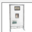
4x7 FreeStanding MeshPanel