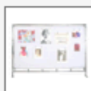
10x7 FreeStanding MeshPanel