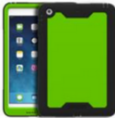
Cyclops Case for Apple iPad Mini 1/2