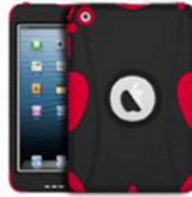
Kraken A.M.S. Case for Apple iPad Mini