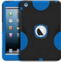
Aegis Case for Apple iPad Mini